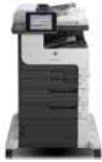
HP LaserJet Enterprise MFP M725f