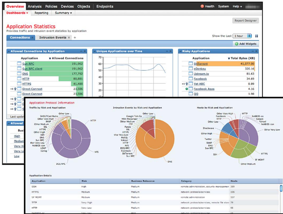
Figure 2. Cisco FireSIGHT Management Center: Intuitive High-level and Detailed Drill-Down Dashboards