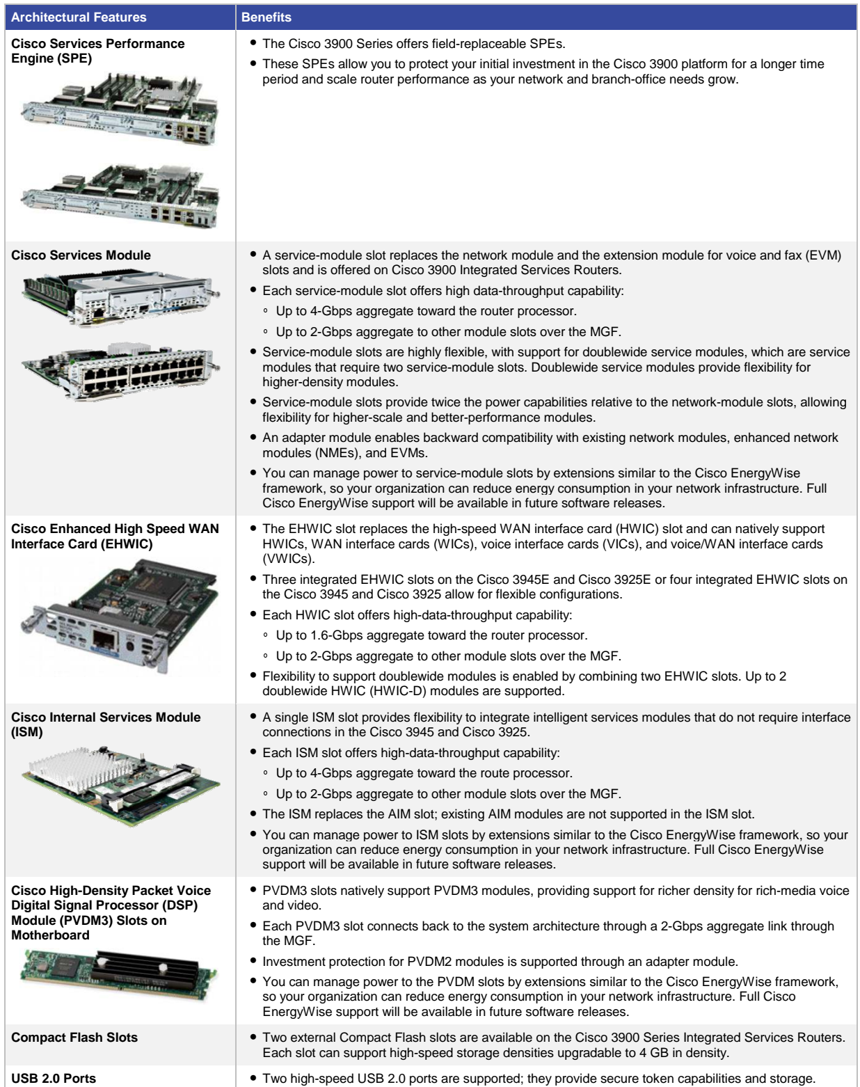
Table 3. Modularity Features and Benefits