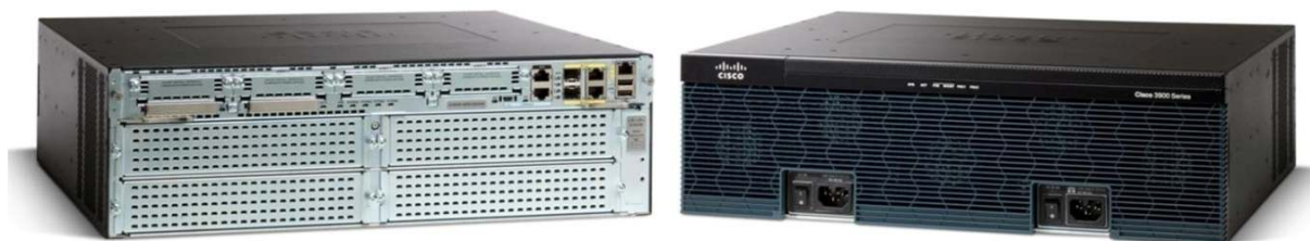
Figure 1. Cisco 3900 Series Integrated Services Routers

Cisco® 3900 Series Integrated Services Routers build on 25 years of Cisco innovation and product leadership. The new Cisco Integrated Services Routers Generation 2 (ISR G2) platforms are architected to enable the next phase of branch-office evolution, providing rich-media collaboration and virtualization to the branch office while maximizing operational cost savings. The new routers support new high-capacity digital signal processors (DSPs) for future enhanced video capabilities, high-powered service modules with improved availability, multicore CPUs, Gigabit Ethernet switching with Cisco Enhanced Power over Ethernet (ePoE), and new energy visibility and control capabilities while enhancing overall system performance. Additionally, a new Cisco IOS® Software Universal image and Cisco Services Ready Engine (SRE) module enable you to decouple the deployment of hardware and software, providing a flexible technology foundation that can quickly adapt to evolving network requirements. Overall, the Cisco 3900 Series offers exceptional total cost of ownership (TCO) savings and network agility through the intelligent integration of market-leading security, unified communications, wireless, and application services.